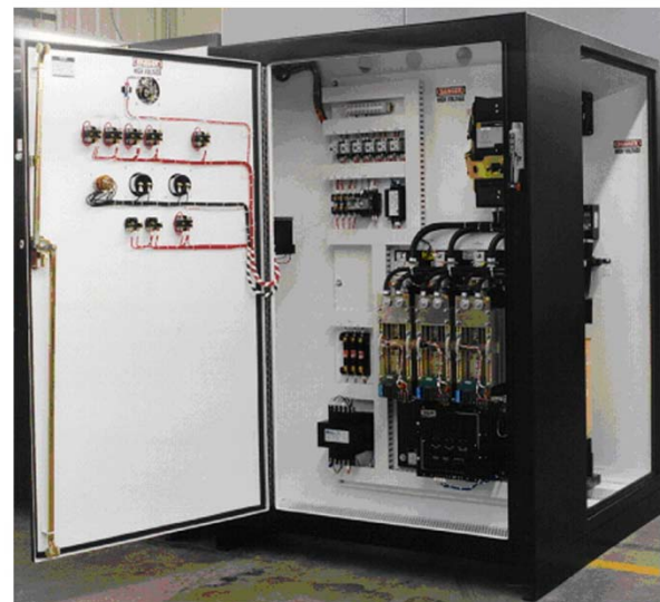
300kW Silicon Carbide Power Supply

This power supply was designed and built by Ametek HDR for a Silicon Carbide heating application. It includes a Circuit Breaker, SCR Power Control, Isolation Transformer (in the rear section), Meters, Alarms and Temperature Controls/Limits.