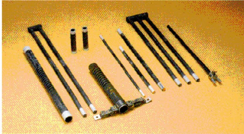
Typical Shapes of Silicon Carbide Heating Elements

Silicon Carbide heating elements have special characteristics that require extra attention when specifying an SCR Power Control. With the information provided in this Application Note, you will be able to specify an SCR Power Control or SCR Power Control/Transformer combination for use in a Silicon Carbide heating application.